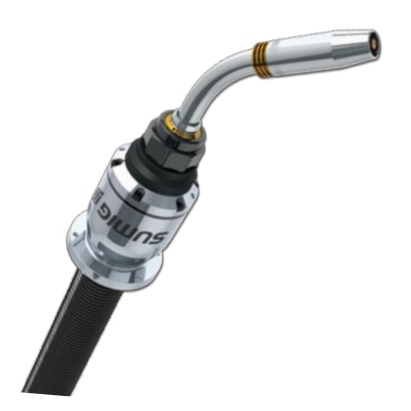
SU477 Robotic Welding Torch